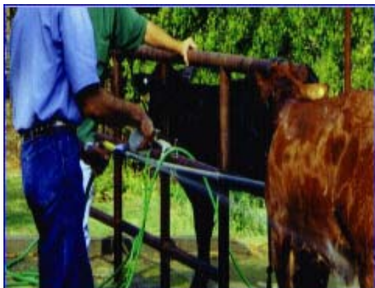
Applying soap into water stream will help to evenly distribute over the body of the animal.