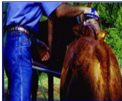
Pay special attention to areas such as the head, make sure that you scrub them adequately to remove all dirt and any other foreign matter.

Washing consists of cleaning the mud, manure, and dirt from the animal/s hair. It is also beneficial in stimulating hair growth. This is a very simple procedure but, you may get very wet at times. You will need the following when washing you animal: water hose, shampoo of you choice (try not to use harsh oil cutting shampoos), and a wash brush. While in the wash rack, secure your animal to the pipe stanchion to restrict his/her movement. Sometimes the wash racks at shows are very full so please try to be considerate of others and wait you turn. Once the animal is secure then wet the entire animal. While you are spraying water on the animal, squirt the soap in the stream of the water. This will evenly disburse the soap on the entire body of the animal. Now comes the important part, take your scrub brush and scrub the entire body of the animal. Don't forget about the face, legs, and underline. It is very important that you get all of these places very clean. Also, don't be afraid to scrub hard, you will not hurt your animal at all. Some kids will just use their hands to wash the animal, much like they wash their own hair, this method however, will not cut the mustard. You must scrub hard. After you have completely washed the animal, rinse all of the soap from the body of the animal. If you do not remove all of the soap residue from the hair coat, your animal may end up with a bad case of dandruff, which can make the animal's hair coat to look "flakey".