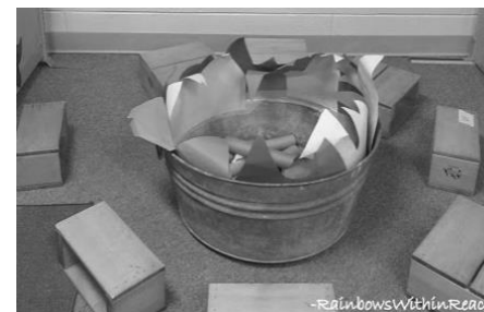
Tin tub, toilet paper rolls, construction paper and wooden blocks